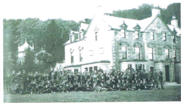
Club members recreating a Photograph taken in 1884